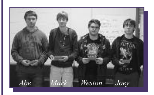
Students receive "Best in Show"

The complete 6th Annual AP District Honor Roll can be found at <a href="https://professionals.collegeboard.com/k-12/awards/ap-district-honor-roll">https://professionals.collegeboard.com/k-12/awards/ap-district-honor-roll</a>.